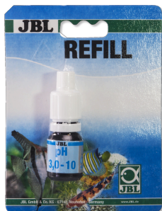
JBL pH Test 3.0-10.0 Quick test to determine the acidity