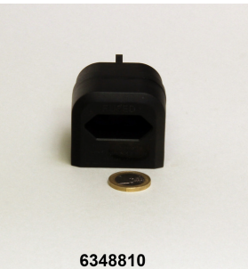
JBL adapter UK for all flat-pin plugs