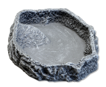
JBL ReptilBar GREY Feeding, drinking, bathing bowl for terrarium animals