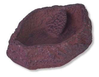
JBL ReptilBar RED Red feeding, drinking, bathing bowl for terrariums