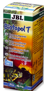
JBL Biotopol T Water conditioner for terrariums