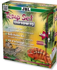
JBL TempSet Unit L-U-W Installation kit for metal-halide lamps