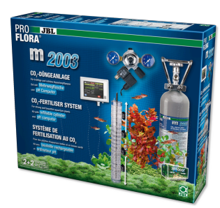
JBL PROFLORA m2003 Plant fertiliser system & 2 kg cylinder & pH control