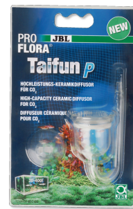
JBL PROFLORA Taifun P Mini CO 2 diffuser for nano freshwater aquariums