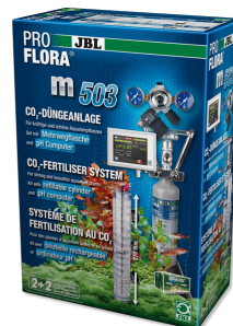
JBL PROFLORA m503 Aquarium plant fertiliser system with pH control