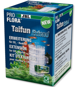
JBL PROFLORA Taifun Extend Extension for CO 2 high-performance diffuser