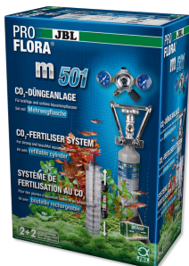
JBL PROFLORA m501 CO2 plant fertiliser system complete kit