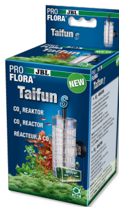
JBL PROFLORA Taifun S Extendable CO 2 diffuser for small aquariums