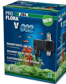
JBL PROFLORA v002 Noiseless solenoid valve