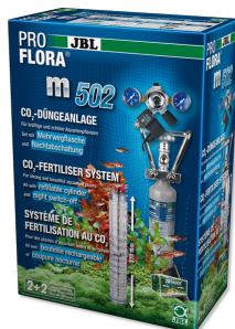
JBL PROFLORA m502 CO2 plant fertiliser system with night switch-off