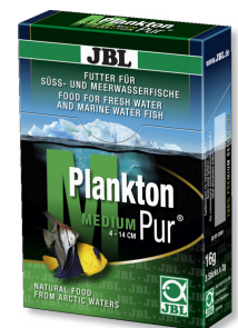
JBL PlanktonPur MEDIUM Treats for large aquarium fish