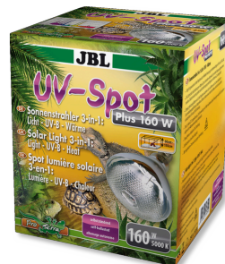
JBL UV-Spot plus UV spotlight with daylight spectrum for terrariums