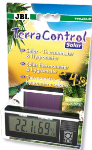
JBL TerraControl Solar Solar-powered thermometer + hygrometer for terrariums