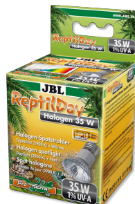
JBL ReptilDay Halogen Halogen spotlight with daylight full spectrum