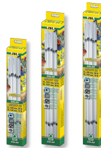
JBL SOLAR Reflect T5/ T8 - 895-1500 mm Reflector panel for fluorescent tube