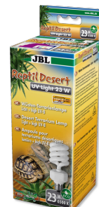
JBL ReptilDesert UV Light Energy-saving lamp for desert terrariums