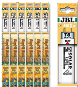
JBL SOLAR REPTIL SUN T8 Special T8 terrarium fluoresc. tube for desert animals