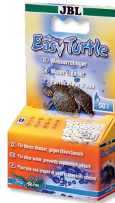
JBL EasyTurtle Special granulate to remove odours