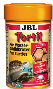
JBL Tortil Food tablets for turtles and pond terrapins