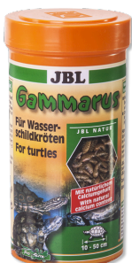
JBL Gammarus Treats for turtles from 10 to 50 cm