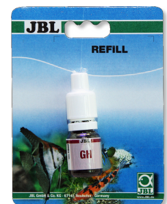
JBL GH Test Quick test to determine the total hardness