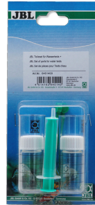
JBL component set for water tests