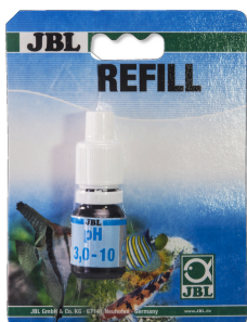
JBL pH Test 3.0-10.0 Quick test to determine the acidity