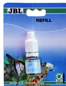
JBL pH Test 7.4-9.0 pH test in aquariums and ponds in the range 7.4-9.0