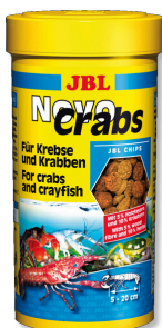
JBL NovoCrabs Main food wafers for crabs