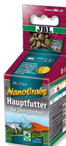
JBL NanoCrabs Main food for dwarf crayfish