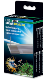
JBL LED SOLAR Hanging Rope hanging fixture for JBL LED SOLAR lights