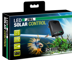
JBL LED SOLAR CONTROL Control unit for JBL LED SOLAR lights