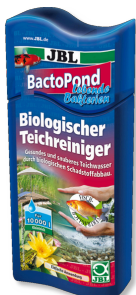
JBL BactoPond Bacteria for biological purification of the pond