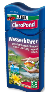
JBL CleroPond Water clarifier for the elimination of water cloudiness