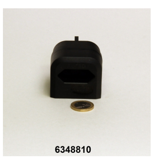
JBL adapter UK for all flat-pin plugs