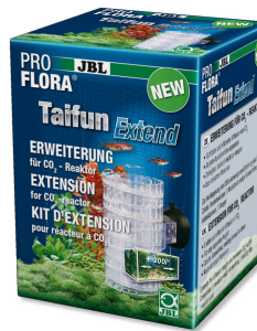
JBL PROFLORA Taifun Extend Extension for CO 2 high-performance diffuser