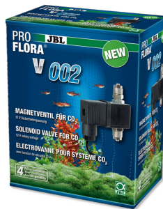
JBL PROFLORA v002 Noiseless solenoid valve