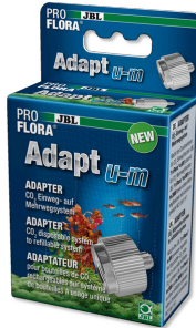
JBL PROFLORA Adapt u-m Conversion adapter for the change over from disposable to refillable cylinder system