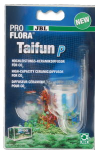
JBL PROFLORA Taifun P Mini CO 2 diffuser for nano freshwater aquariums