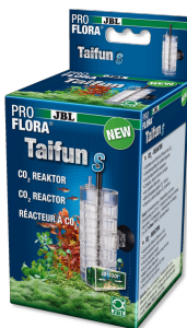
JBL PROFLORA Taifun S Extendable CO 2 diffuser for small aquariums