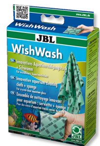
JBL WishWash Cleaning cloth and sponge