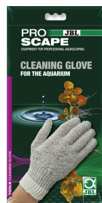
JBL PROSCAPE CLEANING GLOVE Aquarium cleaning glove