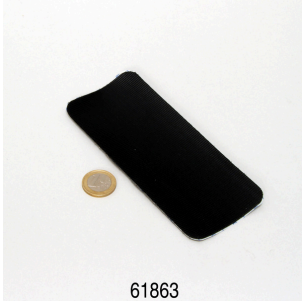
JBL Floaty Pad