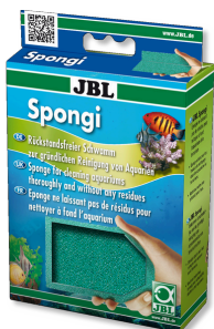
JBL Spongi Cleaning sponge for aquariums and terrariums