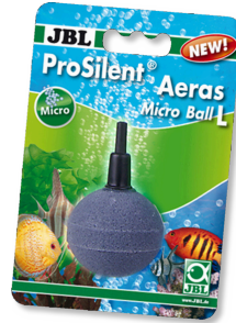
JBL ProSilent Aeras Micro Ball L Air stone for fine air bubbles