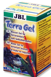
JBL TerraGel Water gel for terrarium animals