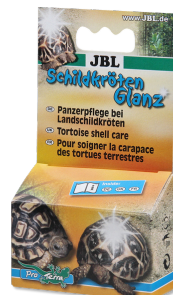
JBL Tortoise shell care Shell care for tortoises