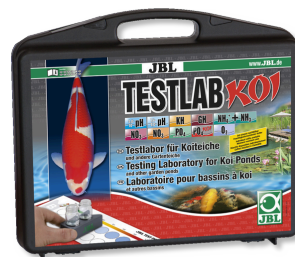
JBL Testlab Koi Professional test case for koi and garden ponds