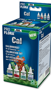
JBL PROFLORA Cal Complete kit for calibration