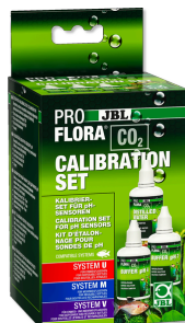
JBL PROFLORA CO2 CALIBRATION SET To calibrate and store pH electrodes