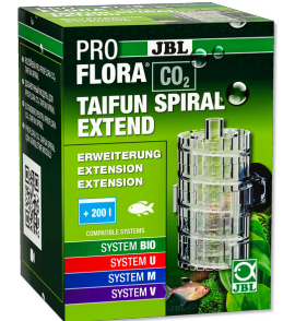
JBL PROFLORA CO2 TAIFUN SPIRAL EXTEND Extension for JBL PROFLORA CO2 TAIFUN SPIRAL 5 / 10