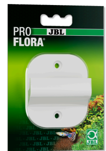
JBL PROFLORA CO2 CYLINDER WALLMOUNT Wall mount for CO2 cylinders with safety bracket