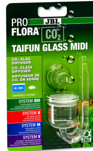
JBL PROFLORA CO2 TAIFUN GLASS Glass CO2 diffuser for freshwater tanks from 40-300 l