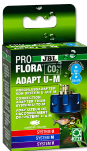
JBL PROFLORA CO2 ADAPT U - M CO2 conversion adapter disposable to refillable bottle