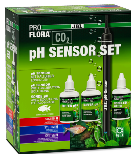
JBL PROFLORA CO2 pH SENSOR SET pH electrode, labor, quality for almost all pH devices