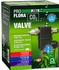
JBL PROFLORA CO2 VALVE CO2 solenoid valve for regulated CO2 addition