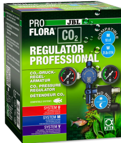
JBL PROFLORA CO2 REGULATOR PROFESSIONAL Pressure regulator with 2 displays & valve for CO2