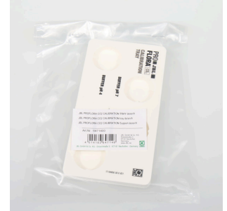
JBL PF CO2 CALIBRATION tray To keep the cuvettes upright during calibration