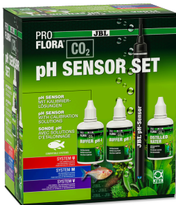
JBL PROFLORA CO2 pH SENSOR SET pH electrode, labor. quality for almost all pH devices