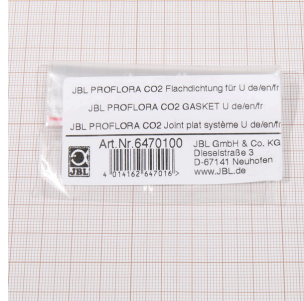
JBL PF CO2 flat gasket for u