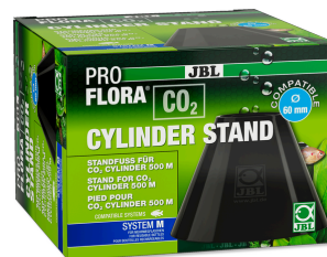
JBL PROFLORA CO2 CYLINDER STAND Stand for 500 g CO2 cylinders