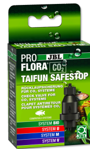
JBL PROFLORA CO2 TAIFUN SAFESTOP Water backflow protection for CO2 systems