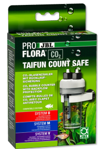
JBL PROFLORA CO2 TAIFUN COUNT SAFE CO2 bubble counter with built-in check valve