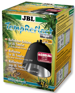
JBL TempReflect light Reflector screen for energy- saving lamps