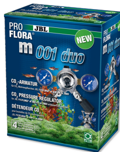
JBL PROFLORA m001 duo Fitting to reduce pressure for 2 CO2 diffusers