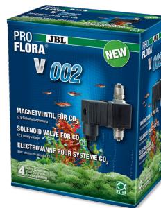
JBL PROFLORA v002 Noiseless solenoid valve