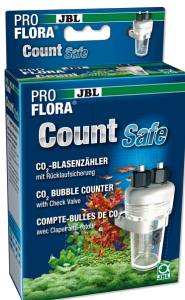
JBL PROFLORA CO2 Count Safe Bubble counter with backflow stop