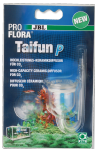
JBL PROFLORA Taifun P Mini CO2 diffuser for nano freshwater aquariums