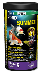
JBL PROPOND SUMMER S Summer food for small koi