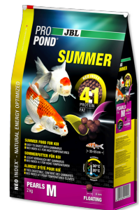
JBL PROPOND SUMMER M Summer food for medium-sized koi