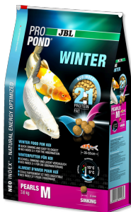
JBL PROPOND WINTER M Winter food for medium-sized koi