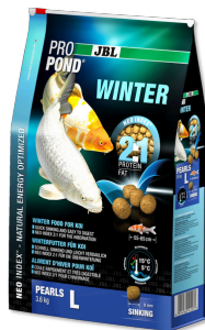
JBL PROPOND WINTER L Winter food for large koi