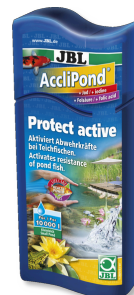
JBL AccliPond Water conditioner for ponds