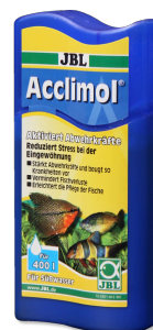
JBL Acclimol Water conditioner for acclimatisation