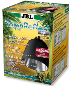
JBL TempReflect light Reflector screen for energy-saving lamps