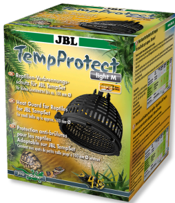
JBL TempProtect light Reptile thermal burn protection for JBL TempSets