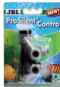
JBL ProSilent Control