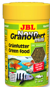
JBL NovoGranoVert mini

Main food granulate for plant-eating fish