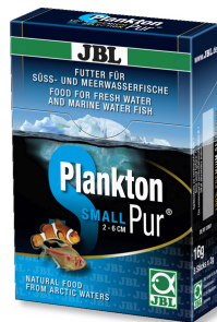
JBL PlanktonPur SMALL Treats for small aquarium fish