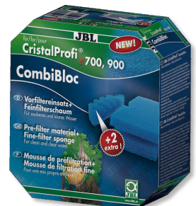
JBL CombiBloc CristalProfi e Pre-filter pads and filter foam for CristalProfi e