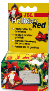
JBL Holiday Red Complete holiday food for goldfish