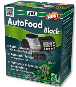
JBL AutoFood BLACK Black automatic feeder for aquarium fish