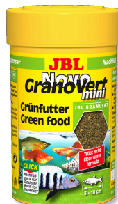
JBL NovoGranoVert mini

Main food granulate for plant-eating fish