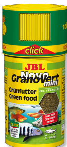
JBL NovoGranoVert mini CLICK

Main food granulate for plant-eating fish