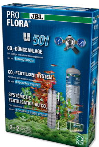
JBL PROFLORA u501 Plant fertiliser system complete kit