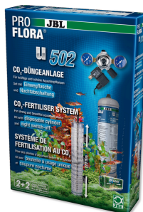
JBL PROFLORA u502 Plant fertiliser system with night switch-off