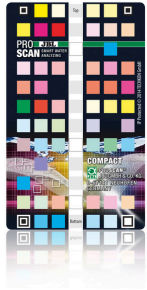
JBL ProScan ColorCard