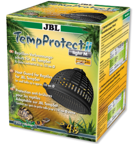
JBL TempProtect II light Reptile thermal burn protection for JBL TempSet items