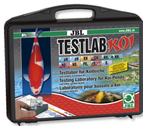
JBL Testlab Koi Professional test case for koi and garden ponds