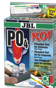
JBL Phosphate Test Kit PO 4 for koi Quick test to determine the phosphate content