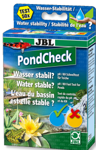
JBL PondCheck Quick test to determine the pH and KH values