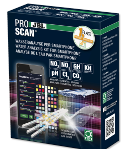
JBL PROSCAN Water test with analysis via smartphone