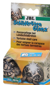
JBL Tortoise shell care Shell care for tortoises