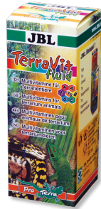
JBL TerraVit fluid Vitamins and trace elements for terrarium animals