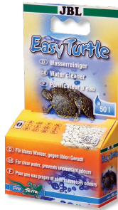
JBL EasyTurtle Special granulate to remove odours