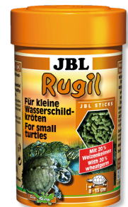
JBL Rugil Food sticks for small turtles