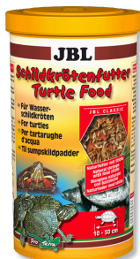
JBL Turtle Food Main food with crayfish for turtles