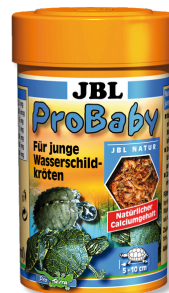
JBL ProBaby Special food for young turtles