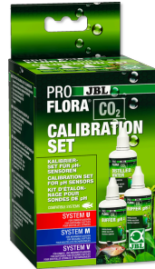
JBL PROFLORA CO 2 CALIBRATION SET To calibrate and store pH electrodes