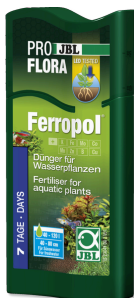
JBL PROFLORA Ferropol

Plant fertiliser for freshwater aquariums