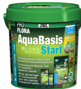
JBL PROFLORA AquaBasis Start

Long-lasting nutrient substrate f. freshwater aquarium