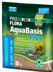
JBL PROFLORA AquaBasis plus

Plant fertiliser for freshwater aquariums