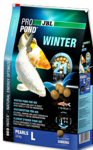
JBL PROPOND WINTER L Winter food for large koi