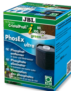
JBL PhosEx Ultra CristalProfi i60/80/100/200

Filter insert with activated carbon for CP i range