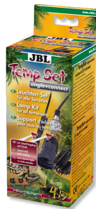
JBL TempSet angle+ connect Installation kit for lamps in terrariums