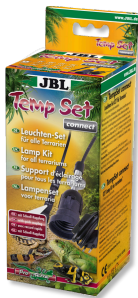
JBL TempSet connect Installation kit with connector