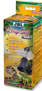
JBL TempSet basic Installation kit for lamps in terrariums