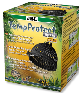
JBL TempProtect light Reptile thermal burn protection for JBL TempSets