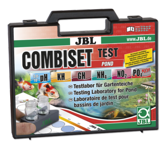
JBL Test Combi Set Pond

Test case with most important water tests + NH4 test