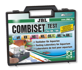
JBL Test Combi Set Plus NH4

Test case with most important water tests + NH4 test