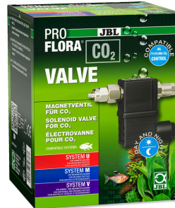
JBL PROFLORA CO2 VALVE CO2 solenoid valve for regulated CO2 addition