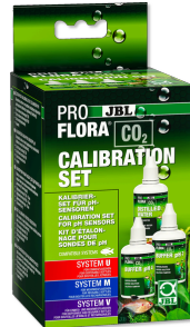
JBL PROFLORA CO2 CALIBRATION SET To calibrate and store pH electrodes