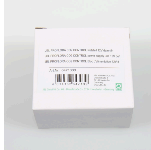
JBL PF CO2 CONTROL power supply unit 12V