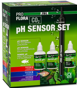
JBL PROFLORA CO2 pH SENSOR SET pH electrode, labor. quality for almost all pH devices