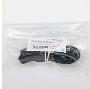
JBL PF CO2 CONTROL temperature sensor